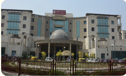
SGPGIMS (Sanjay Gandhi Postgraduate Institute of Medical Sciences