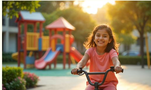
THE PERFECT PLAY AREA