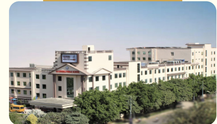
GD GOENKA Public school