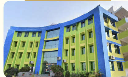
The Millennium Schools