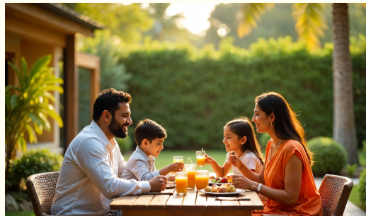
EXPERIENCE LUXURY LIVING