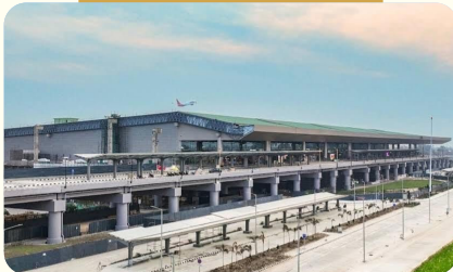
Lucknow Airport / Chaudhary Charan Singh International Airport