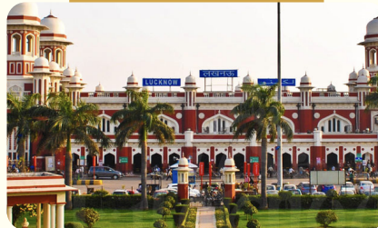
Charbagh Railway station