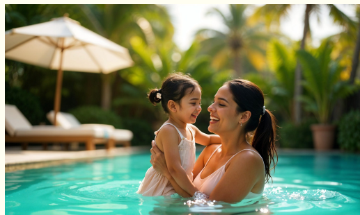
LAVISH SWIMMING POOL @GOCLUB