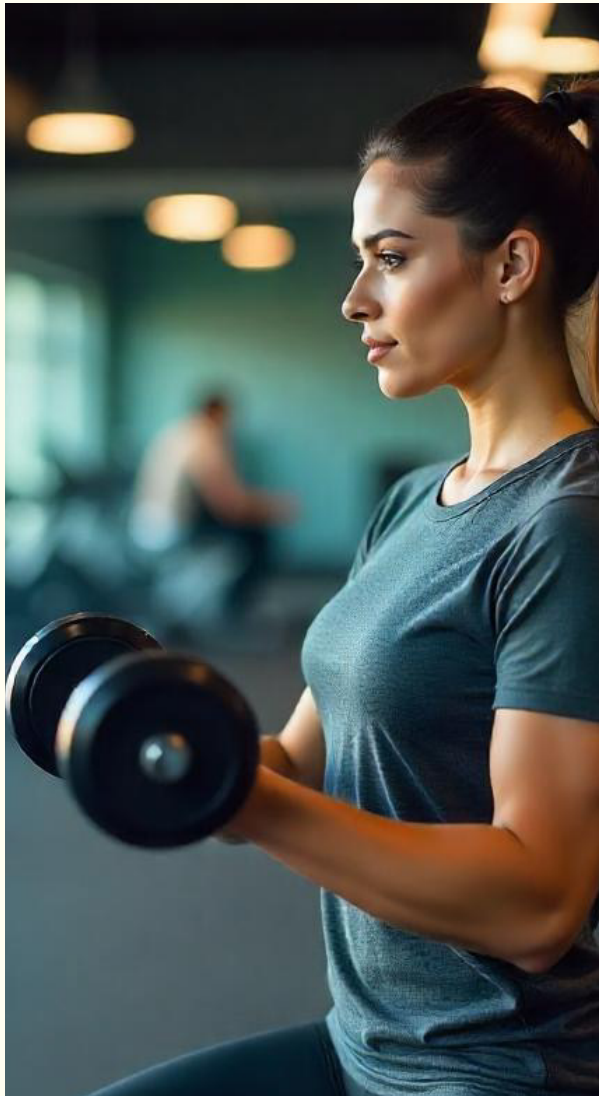
THE ULTIMATE GYM