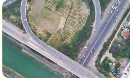
Outer Ring Road (Kisaan Path)